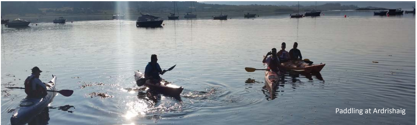
Paddling at Ardrishaig