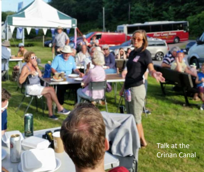
Talk at the Crinan Canal