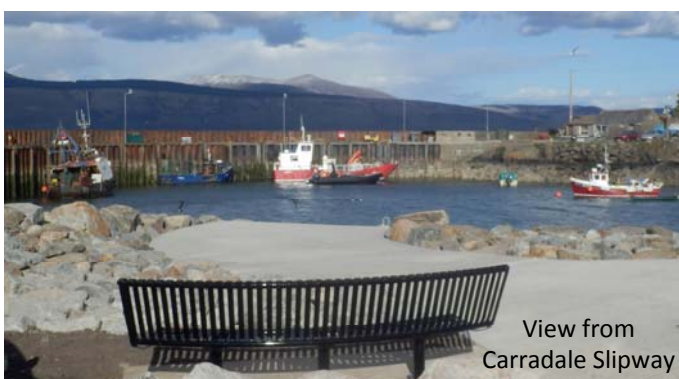
View from Carradale Slipway

The Social Enterprise Team (SET) has supported CHEL by attending site meetings with the main contractor, providing an interface with other council departments, facilitating a cash flow loan from the council, providing support with the FLAG claims, monitoring of cash flow and any other ad hoc support that has been required.