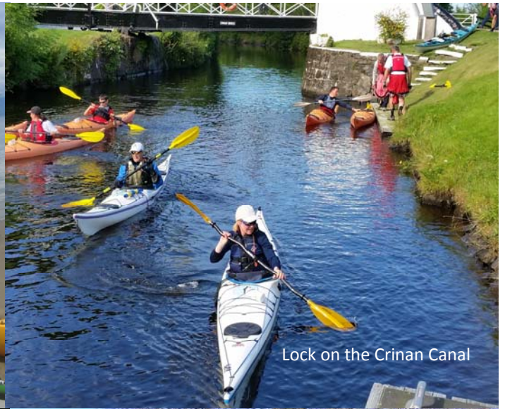
Lock on the Crinan Canal