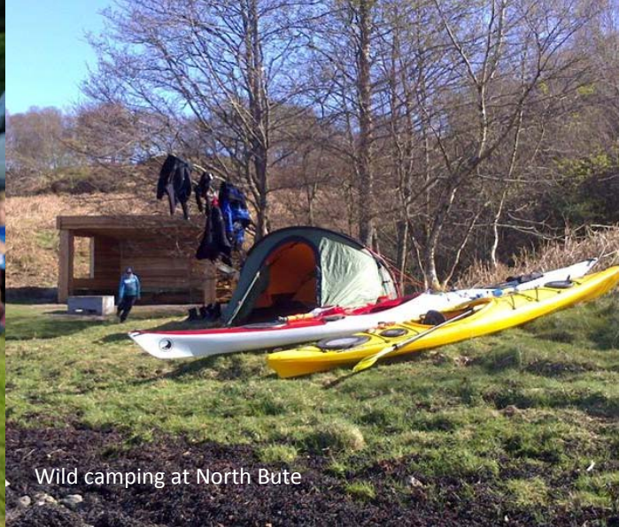
Wild camping at North Bute