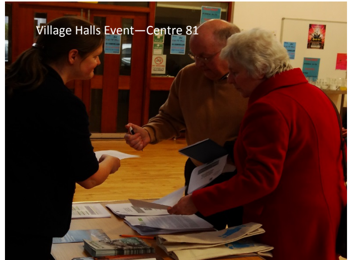
Village Halls Event—Centre 81