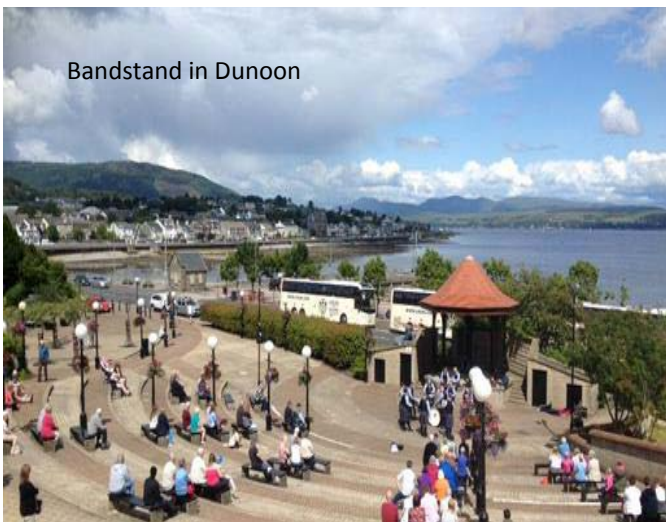
Bandstand in Dunoon