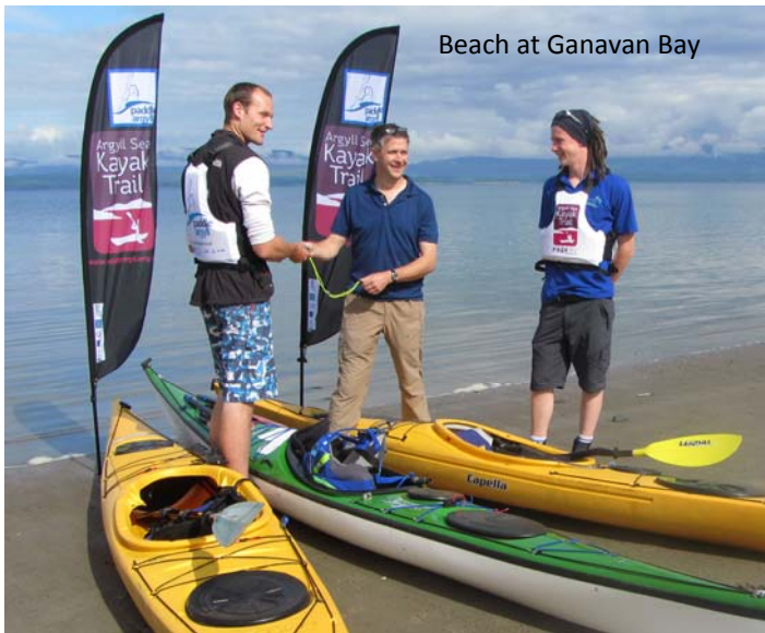
Beach at Ganavan Bay